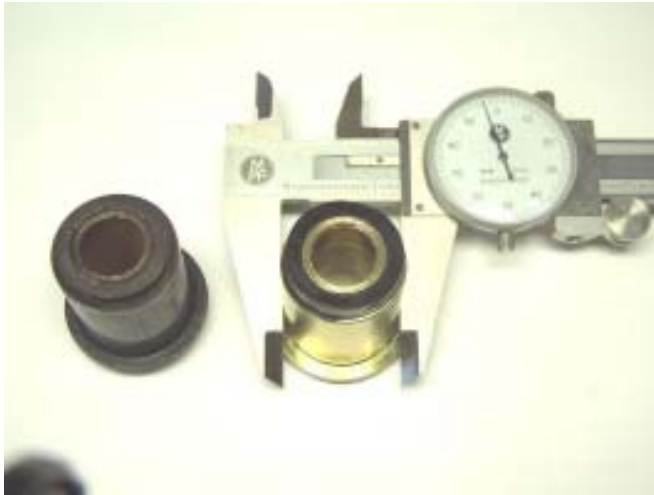
Figure 1. This is typical of current bushing availability. This bushing starts out at 1.290 and tapers to 1.297 near the flanged end.

It is possible to hone the A-arm tubes to accept these oversize shells but once current manufacturing problem is resolved, that set of A-arms will the forever require oversize bushings requiring Loctite, or some other cure to hold them in place at the next service. The best all around solution is to correct the diameters of the bushings.