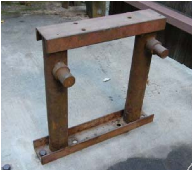
Figure 9. Here's a shot of my Alignment fixture. It bolts solidly to the concrete so that I can apply a lot of force to obtain alignment.

All four of the A-arm tubes will generally require a tweak of bore alignment prior to pressing the bushings into position. This has always been a requirement. I use a long brass rod that just fits through the respective tube bores and a plug of the same size bolted to the floor.