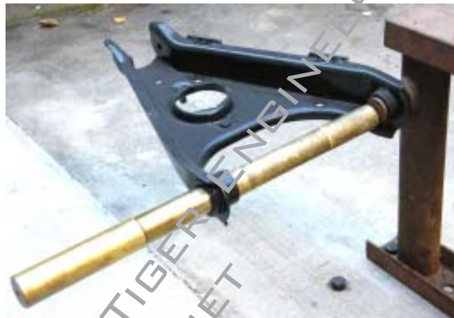
Figure 11. Here we're starting the process of alignment. The rod is sized to be a tight slip fit through the bushing tubes. Note that the misalignment seen in this photo is in the rear tube. I reverse the A-arm on the fixture and apply force using the brass bar to hex it toward the correct position.

all over again. I recommend that you do the reinforcement work first to avoid this possibility.