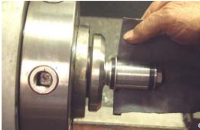
Figures 5. & 6. Here's how to get the surface as smooth as possible, filing and sanding.

When it comes to installation, I like to grease the shells prior to pressing them into place. I know that some instructions say not to do this but I'd rather have to clean off the grease to apply 609 Locute (cylindrical fit formula) if it's too loose than destroy the shell if it's too tight for a dry press fit. It is critical to align the bushings with the bores as you start to push them into place. If they start crooked they generally stay crooked and end up all bent up. I have a tool for pushing the bushings that has a machined recess for the urethane on the large end. this allows the force of the press to be applied directly and evenly to the flange on the bushing shell.