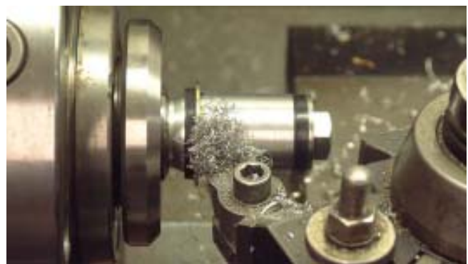
Figure 4. Kind of like making steel wool.

Because the shell is riding on the Urethane, there is a minimum that you can cut without having the shell simply ride on the end of the tool. When you approach the final diameter, it's also possible to file and sand the shell diameter to continue minor reductions and smooth the surface. As previously stated, your objective is a press fit of about 0.003". You may need to measure and cut for each bushing tube. Marking the bushings LF, LR, RF, RR helps keep track of the target location.