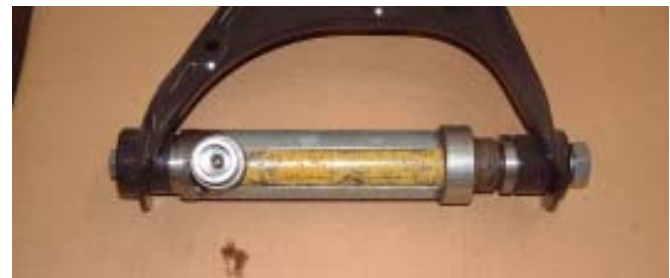
Figure 8. Here's the ram in place. The stiffness of the assembly keeps the bores in alignment while spreading them farther apart.