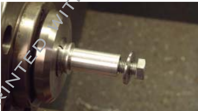
Figure 2. Bushing Arbor, the bushing just fits on the diameter and the bolt and washer clamp it solid without distorting the urethane excessively.

I use a Bushing Arbor sized to accept a light slip fit of the typical bushing with an internal thread to accept a washer and bolt to clamp the bushing tightly.