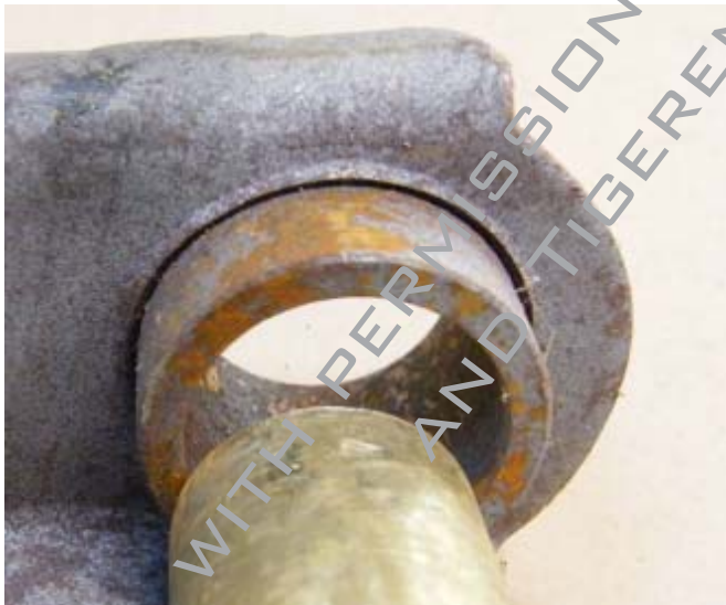
Figure 10. This is typical of the misalignment you will find when you start this process. Note this A-arm is not reinforced.

You know your done when the brass rod slides through both bores. Be advised, if you hear a pop or snap during the alignment of the bushing tubes, it's likely the spin weld fracturing. This means you get to go back to a far earlier step, perform the appropriate reinforcement welding, repaint, and begin the alignment process