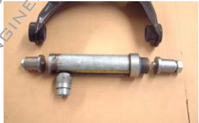
Figure 7. The hydraulic ram sits snugly inside a piece of pipe with a threaded plug on one end. A steel plug fits into the A-arm Tube from the inside and bolts to the plug. The other end has a similar steel plug with a bolt sized to the thread of the cylinder bore.

The Factory Manual indicates the distance is supposed to be 12.00 inches, measured from inside to inside. I've found that this distance works OK for rubber bushings because the rubber doesn't exhibit the tendency to cold flow out of position. For Urethane bushings, it is preferable to use a minimum dimension of 12.200". To obtain this dimension, I developed a custom tool for my hydraulic ram.