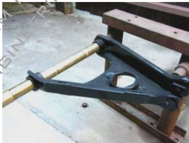
Figure 12. After the appropriate adjustments, the brass rod now slides through both bushing bores and the bushings will be in good alignment.

You will need the proper tooling to hold the A-arms and guide the bushings while appropriately spreading the pressure of the ram on the big end of the bushing. I've described this part of the operation in previous Tech Tips. You will find this tip and others on my web site www.tigerengineering.net .