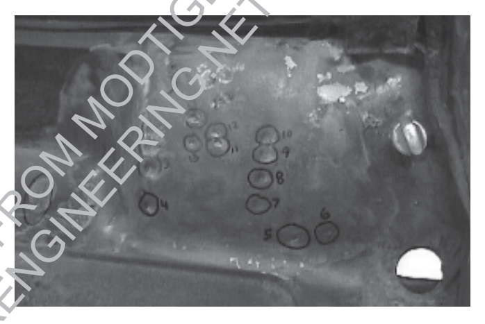
Figure 3. Here we have an overall shot of the spot welds behind the drivers seat. You will have to do a lot of cleanup to get down to this level.

The photo's below are inside the passenger compartment behind the seats. The rear subfrance assembly is spot welded to the body tub and these words are what you are looking at. When the frame tab (shown in Figure 2) cracks, these welds begin to assume the structural loading. They begin pulling apart and the local "dishing" of the floor pan leads to the cracking evident in these photographs.