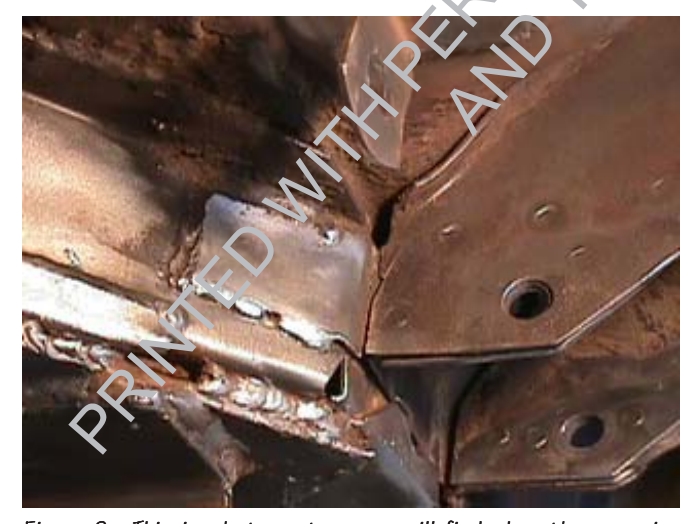
Figure 2. This is what most owners will find when they examine the front mounting area for the leaf springs. This crack is only the most visable failure point. It occurs because this location is a natural "hinge" in the chassis structure where the rear sub frame joins the body tub and X member.

Before we get into the actual procedures to install the various pieces of this kit, I'm going to show you a few pictures that will help you decide if you need this type of reinforcement now, if you can put it off for a while, or your problem is even more serious. Figure 2, below shows the typical Tiger traine in the area of the rear spring attachment. The area shown bus obviously been cleaned up and stripped of undercoating. It is much harder to see this failure when it hasn't been cleaned. It remains one of the most common fatugue failure points in the Tiger.