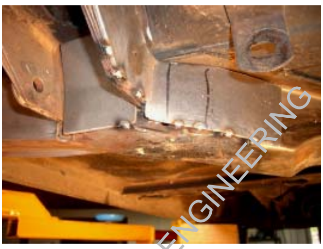
Figure 11. The first two pieces of reinforcment have been fit and tack welded into final position.