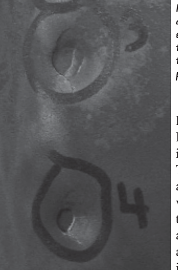
Figure 4. Here we have a closeup of the spot welds shown above. It is clear that the floor plan is failing and that the rear sub frame is pulling away.

The MTE Structural Repair Kit is designed to Bridge the natural hinge existing in the Tiger chassis. The plates are to be formed as required and welded to the various chassis components thus carrying the stress loads across this area. Appropriate repairs to minimize existing damage and separation of