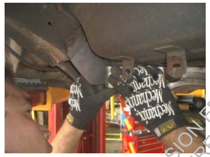
Figure 9. "Fitting" the side piece to the chassis