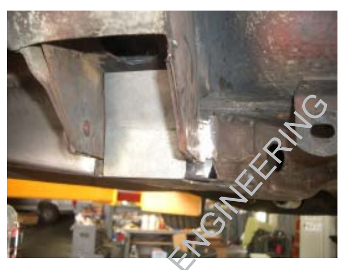
Figure 6. Here is the rectangular piece, bent and placed into position. Note that is just relow flush with the bottom of the chassis. You will be welding this edge, so you don't want it too high.

The Yn has three pieces for each side of the rear spring mount. The smaller rectangular piece should fit in between the two vertical sides of the spring mount. It should have a slight bend near the center to allow it to fit flush with the structure in the front of this opening. The second piece should be bent as shown in Figure 7 allowing it to fit flush with the sides of the subframe and the side of the X-member. The Tiger chassis has minor production variations in this area and each piece must be carefully fit for the specific application.