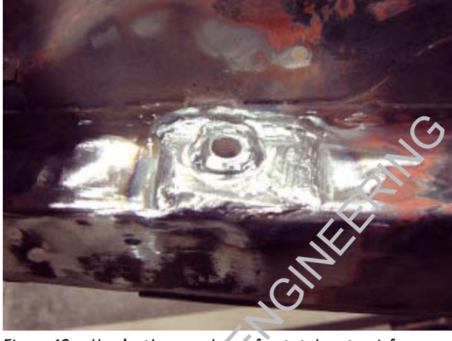
Figure 19. Here's the complete front tubenut reinforcement welded and completed. If you get this reinforcement piece applied before the tube nut starts it's typical fatigue failure mode, you can save a lot of future problems and help keep your Tiger structurally so ind

Figure 19 shows the completed reinforcement at the Tubenut. You can make it a little neater with a TIG welder, but in any case, you're going to want to weld all the way around the plate and the tubenut. Be careful when welding the tubenut to the plate, as you don't want to melt into the threads. It's also a good idea to chase the internal 1/2-20 threads after you finish welding. This is a place that collects a lot of debris over the years and chasing the threads will save wear and tear on both the nut and the crossmember connecting bolts.