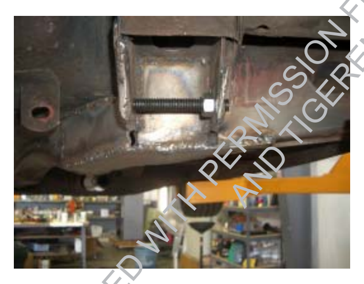
Figure 14. Here's inv drill fixture. It's a piece of 7/16 threaded stock with a 1/4" hole drilled through the center. Inserting this piece and ightening the nut as shown, allows the center of the inner hole to be pilot drilled avoiding any enlargement of the original 7/16 hole.

With the welding and grinding done, one task remains and that is to complete the 7/16 Dia hole for the spring mounting bolt. I've done this two ways. One was to use a 7/16 reduced shank drill with my angle drill, and simply drill through from the outside. The second requires a piece if threaded stock with a center hole. This allows a smaller pilot hole to be drilled through the reinforcing plate, which can then be enlarged from the center of the chassis, without gouging the OEM hole as the direct 7/16 drill sometimes does.