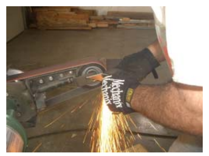
Figure 8. Here we "adjust" the shape to make the perfect fit.