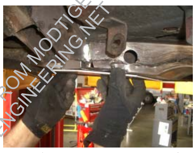
Figure 12. The bottom plate should be a pretty close fit to the side and inside piece where they will be welded together. Some angular adjustment may be necessary with the sanding belt. It's also a good idea to hammer the metal to form joints that can be be welded into a tight configuratation so that the end result is as smooth and uniform as possible.