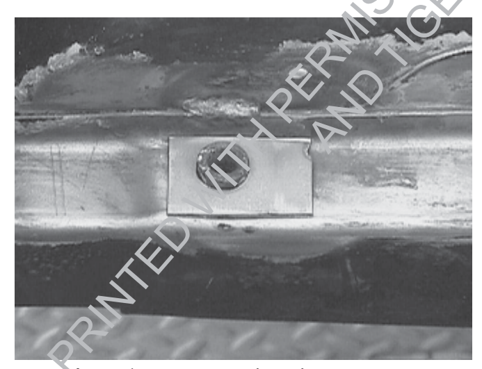
Figure 18 Here's the location of the front tube nut with the reinforcing plate in place, but unwelded. The concept is that this plate, when welded to the top of the tube nut, can carry the loads to the sides of the frame stamping. To assure this load transfer, the perimeter of the reinforcing plate is welded to the frame. In order to get this plate to fit flush as shown, some combination of grinding of the factory welds and countersinking of the hole, from the bottom, is necessary.