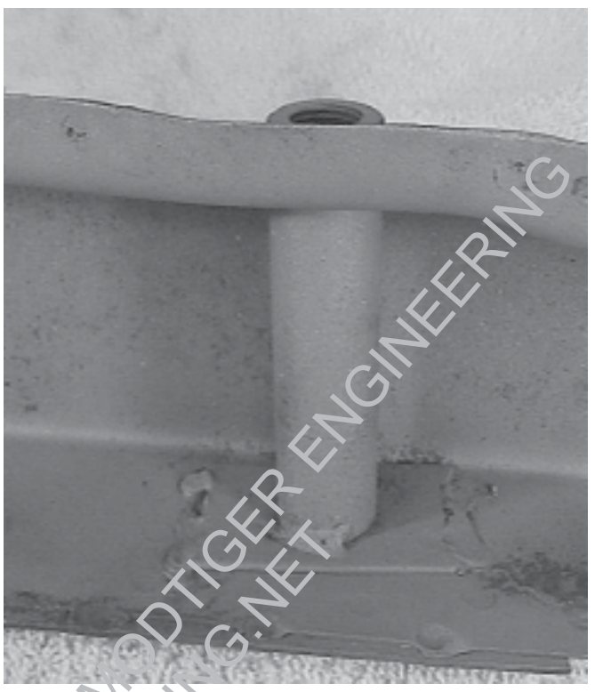
Figure 15. This is that you'd find if you looked inside the front frame horns. As you can see, the tubenut is simply tacked in place.

This completes the reinforcement of the front spring mount. As you can see, these additional pieces effectively bridge the hinge in the OEM design. It's still a good idea to keep an eye on this area, particularly if your frequently applying aggressive driving loads. Now it's on to similiar problems at the front frame horns.