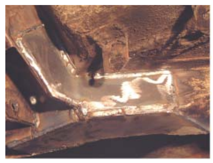
Figure 13. Here we have the finished application to the kit to the rear spring mount. Some minor weld dressing has been done and more can be done, but this gives you the general idea.

With the welding and grinding done, one task remains and that is to complete the 7/16 Dia hole for the spring mounting bolt. I've done this two ways. One was to use a 7/16 reduced shank drill with my angle drill, and simply drill through from the outside. The second requires a piece if threaded stock with a center hole. This allows a smaller pilot hole to be drilled through the reinforcing plate, which can then be enlarged from the center of the chassis, without gouging the OEM hole as the direct 7/16 drill sometimes does.