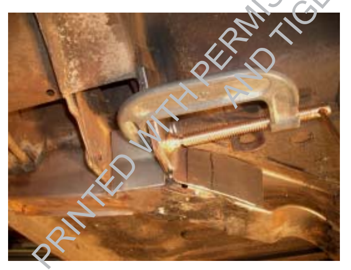
Figure 10. Here's the side piece and the front piece clamped into position, ready for tack welding.

Now that these pieces are fit, we're ready to tack them into position. Remember to leave a little (approximately 1/16") hanging below the OEM structure for attacment of the bottom piece of reinforcement.