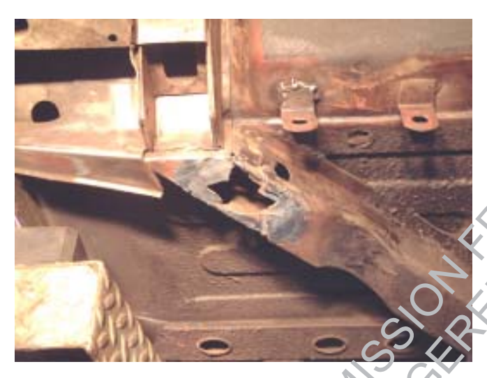
Figure 5. Here we have a typical Tiger frame that has 'lost' the Weld-On Traction Master frame mount. The Wold-On mount is one of the weaker points and has often been torn off and rewelded to the X-member several times, equility in this kind of damage. My recomendation is to ewitch to the Solt-On design for the traction bars or eliminate them and use the Dan Walters developed Torque Arm (909 $25.1572).

Actually, the wire brush, a putty knife type scraper, and a propane torch are the best tools to remove the accumulated road dirt, undercoating and paint necessary to install this kits components. Make sure that you remove flamable materials on the "other" side of the area you're cleaning at any time you use any heat source to loosen surface materials. A friend, assigned to the duty of fire watch, prepaired with appropriate extinguishing materials, is also a manditory requirement to protect your investment.