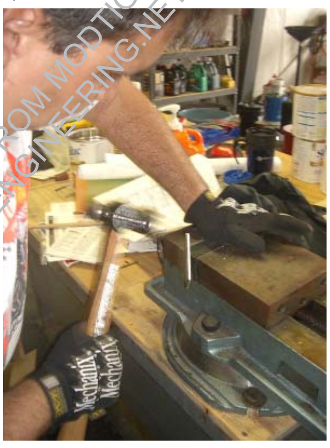
Figure 7. Here you can see how the side plate is bent to fit. Take your time and work this piece gradually. It's easier to bend it a little at a time than to unbend and rebend. If the location of the bend is not obvious to you, cut a replica out of cardboard and fit that first. Then transfer the bend location to the steel piece.

Remember, this is a universal kit and each chassis may require some minor adjustments to make the "fit" come out right for your application. Figure 8 shows some of this tweeking on the sanding wheel.