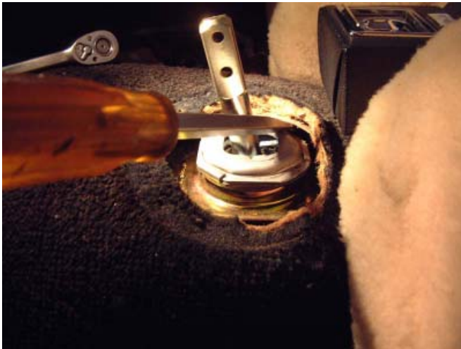
Fig 13 If things are a little tight down here, you can "adjust" the sheet metal around the edge of the hole

I'd take a quick look to see if you need to cleanup and RTV that was inadvertently transferred to upholstery or rugs. Then its time to place the 4 bolts and tighten them down. Start all 4 before you tighten any all the way down. I like to smooth out the RTV at the front of the shifter, but the rest should take care of itself. Then you can dab a little grease on the internals and reinstall the short rubber boot on the shifter.