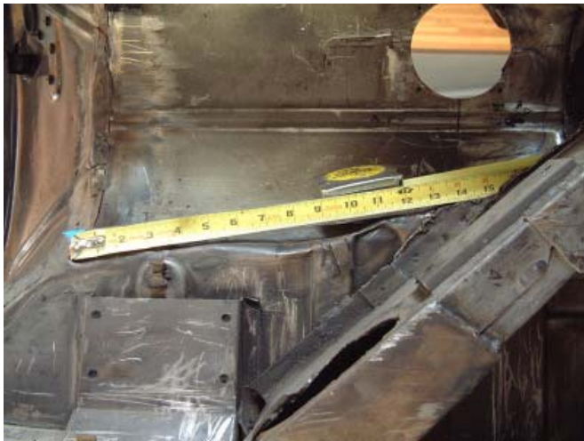
Fig 8 Another chassis, same alteration. This dent is the area where the bolt was removed from the side if the T5 transmission. If you made this dent another inch deep, the transmission would fit without removing the bolt.