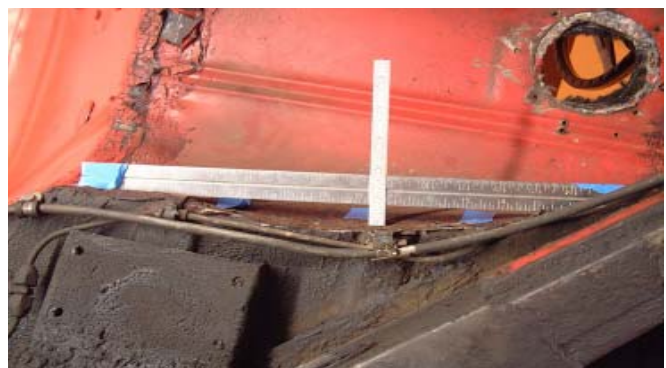
Fig 7 Here's the after shot. Bend the sheetmetal clamp over the fuel line.

I use a 2 lb hammer to move the metal most efficiently. Starting at the front of the tunnel, drive the side of the tunnel towards the outside. The floor, the joint between the floor and the tunnel and the side of the tunnel will be moved as shown. The movement peaks at about 5/8 deep about 8 inches from the front, and tapers from that point to the front and rear. The dent is no more than 2" above the floor.