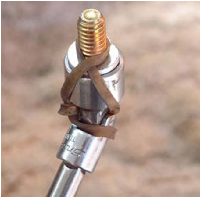
Fig 12 Here's my trick for holding the screw and lock washer in the socket while you position it, screw down, through the RTV into the shifter and tailhousing.