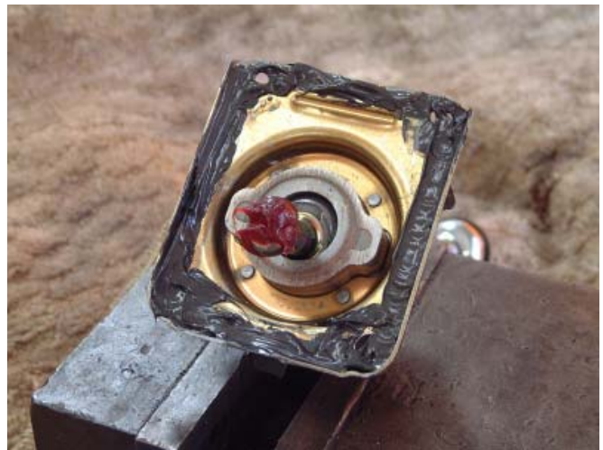
Fig 11. Here's the Modified T56 shifter ready to drop through the stock shifter hole into the tailhousing. A blob of grease lubricates the ball where it slips into the nylon bushing.

Locate the engine and install the motor mounts first. Let the tailhousing rest on the frame. You will need all the space you can get to install the shifter. I normally leave the 4 bolts in the cover plate during placement this allows me to raise the transmission up against the top of the tunnel and press in a little clearance. The installation of the modified T56 shifter is really the trickiest part of the installation. After adding the balance of the 2.5 quarts of lubricant (Mercon V ATF recommended), retrieve the four attachment bolts from the tailhousing. Remove the rubber boot from the shifter for now as it restricts already limited access to the bolts. You will need a 1/4” drive 1/2” hex universal socket, or something very similar, to install the shifter bolts. The bolt and lock washer must be retained by the socket or they will fall out as you try to place them. I normally use a rubber band for this retention but you may have another favorite method (figure 12).