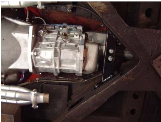
Fig 9 When it all goes together, it looks like this. The Rear Mount shown here was an earlier design version. It significantly easier to get to the rear bolts with the new mount design. At the top of this shot you can also see the new routing of the speedometer cable in this area. It will no longer go through the frame, but will run inside the frame rail. It will need a new support to keep it off the exhaust system.