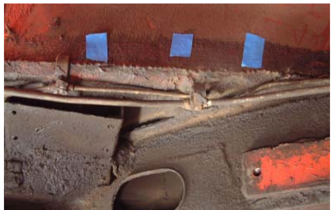
Fig 6 Here's a before shot from below of the transmission tunnel on the right side. Take note of the OEM sheetmetal tubing clips as they provide your best location guidance. Start by removing the fuel line and bending it towards the outside. Bend the clip in the same direction.

Next we turn our attention to the transmission tunnel. The following adjustment is the only modification required to fit the MTE Transmission into the Tiger, and it is not only very unobtrusive, it is reversible, should you so choose.