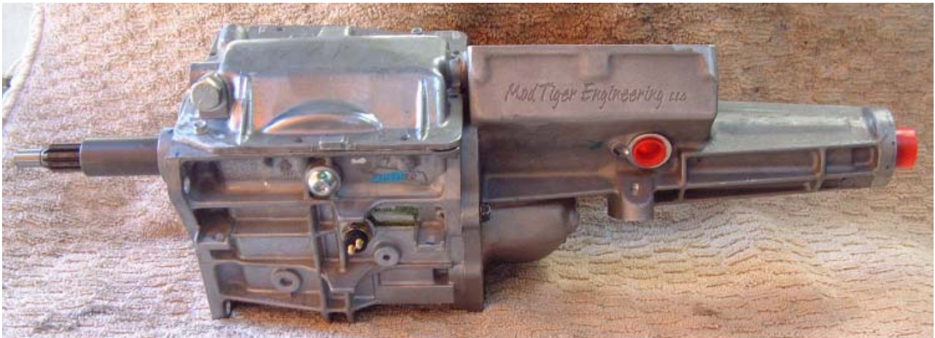
Fig 1 The assembled MTE T5 Transmission

These instructions will outline the basic steps required to install the completed MTE T5 Transmission into a Sunbeam Tiger. I'm making the assumption that you have done this several times with the OEM Top Loader and only need the guidance to alter your normal procedures as they are affected by the T5. We advocate and use the engine out- and-in the bottom technique, but that is not really a point of discussion in this procedure.