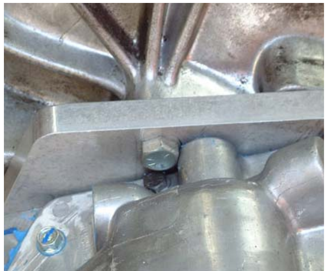
Fig 2 Turn the hex on the five bolt adapter as shown.

The 5 bolt adapter also requires that the top left bolt be tightened so that the flat of the hex fits next to the Shift Rod bushing on the top of the transmission (Figure 2). It doesn't touch, but it's very close. I don't use a lock washer here either. The 6 bolt adapter does not have this close proximity situation.