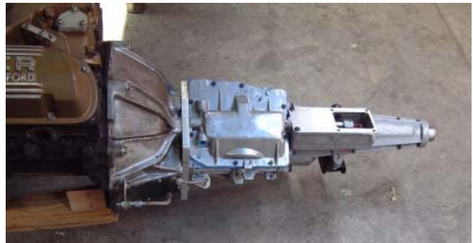
Fig 5 Here's the assembly ready for installation. Note that the Shifter mechanism has been removed, but the cover plate remains in place. It won't go into place with the shifter installed.

With the adapter correctly placed, it's time to install the throwout bearing and fit the transmission. The T5 is lighter than the Top Loader so this task is a little easier. I like to use a floor jack to support the transmission at the proper elevation as the input shaft enters the clutch and finally the pilot bearing. Another trick is to use a longer 7/16 bolt with the head cut off to maintain alignment as assembly progresses. When it fits up to the adapter, it's time to install the connecting bolts. Note that the bolts only penetrate the 5/8 depth of the adapter. The correct length bolts have been supplied. Do not use longer bolts as they may bottom and tighten before the transmission pulls up.