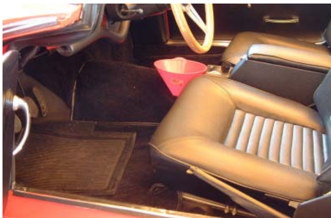
Fig 10 Here's the funnel I use to add the required Lubricant BEFORE installing the shifter mechanism.

When you have “adjusted” the side of the transmission tunnel as shown in the pictures, you’re ready to reinstall the engine transmission assembly. I’m assuming you’ve done this before and the T5 transmission requires no special considerations other than having plugs in the openings so that the ATF doesn’t run out.